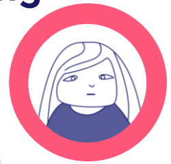
'Outsider' or Bystander'